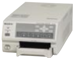
70-5290 Sony Printer