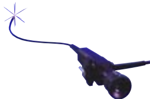
Machida 3L / 4L